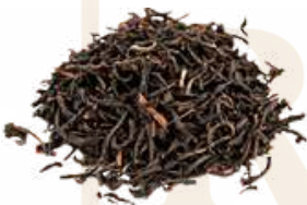
GRADE : TGFOP1 WHOLE LEAF TEA