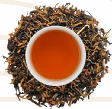
ORGANIC ASSAM ORTHODOX TEA