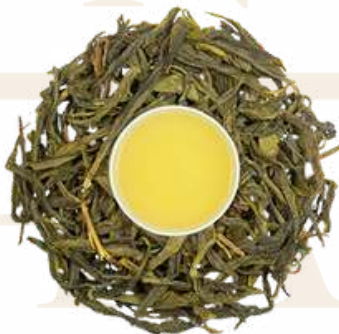
RARE ASSAM GREEN TEA