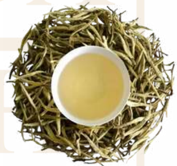
DARJEELING 1st FLUSH WHITE TEA