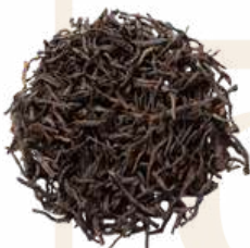
GRADE : GFOP / PEKOE MEDIUM SIZE LEAF