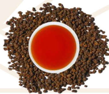
ASSAM CTC TEA (2nd FLUSH)