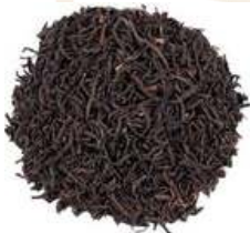
GRADE : FTGFOP1 WHOLE LEAF TEA