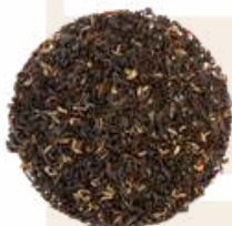
GRADE : GBOP SMALL SIZE LEAF