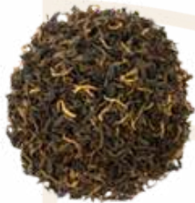
GRADE : STGFOP1 WHOLE LEAF TEA

From the misty gardens of Assam, we bring you our finest Orthodox Black Teas-the soul of Assam's tea heritage. at Ronga Chah Group, we carry this legacy forward with pride. each leaf is handpicked with love,crafted with care and meticulously processed using time-honored methods, our Orthodox teas offer a full-bodied, malty flavor that sets them apart on the global stage.